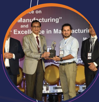
Grindmaster Machines Pvt. Ltd, Aurangabad

Winner for Gender Diversity and Inclusion (Large Enterprise)