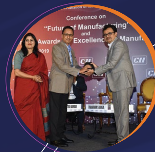
Takshi Auto Components Pvt. Ltd, Pune

spirit of development of manufacturing excellence, at the firm level, with an aim to become globally competitive