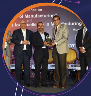
Cummins India Ltd, Pune

Winner for Operational Excellence (SMEs)