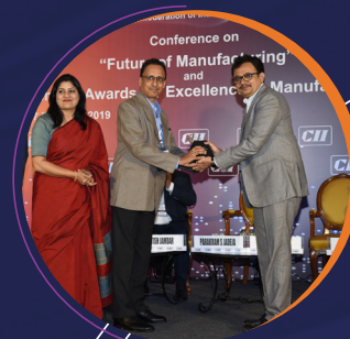
Takshi Auto Components Pvt. Ltd, Pune

spirit of development of the manufacturing excellence, at the firm level, with an aim to become globally competitive