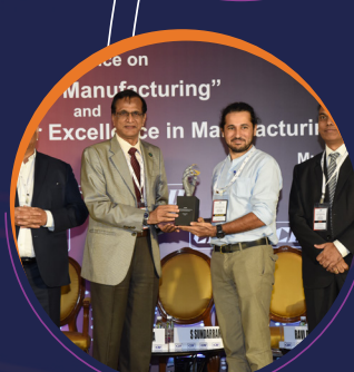
Grindmaster Machines Pvt. Ltd, Aurangabad

Winner for Gender Diversity and Inclusion (Large Enterprise)