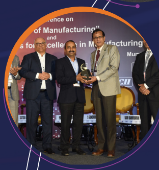
Cummins India Ltd, Pune

Winner for Operational Excellence (SMEs)